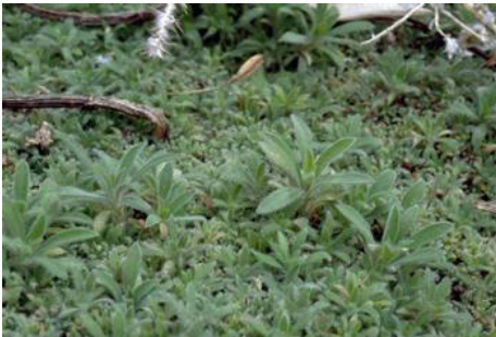
Figure 2. Kochia seedlings.