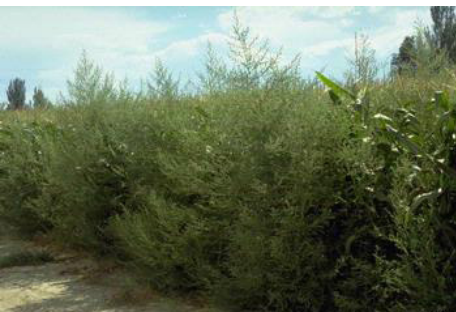
Figure 3. Mature kochia.