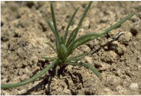
Figure 1. Russian thistle seedling.